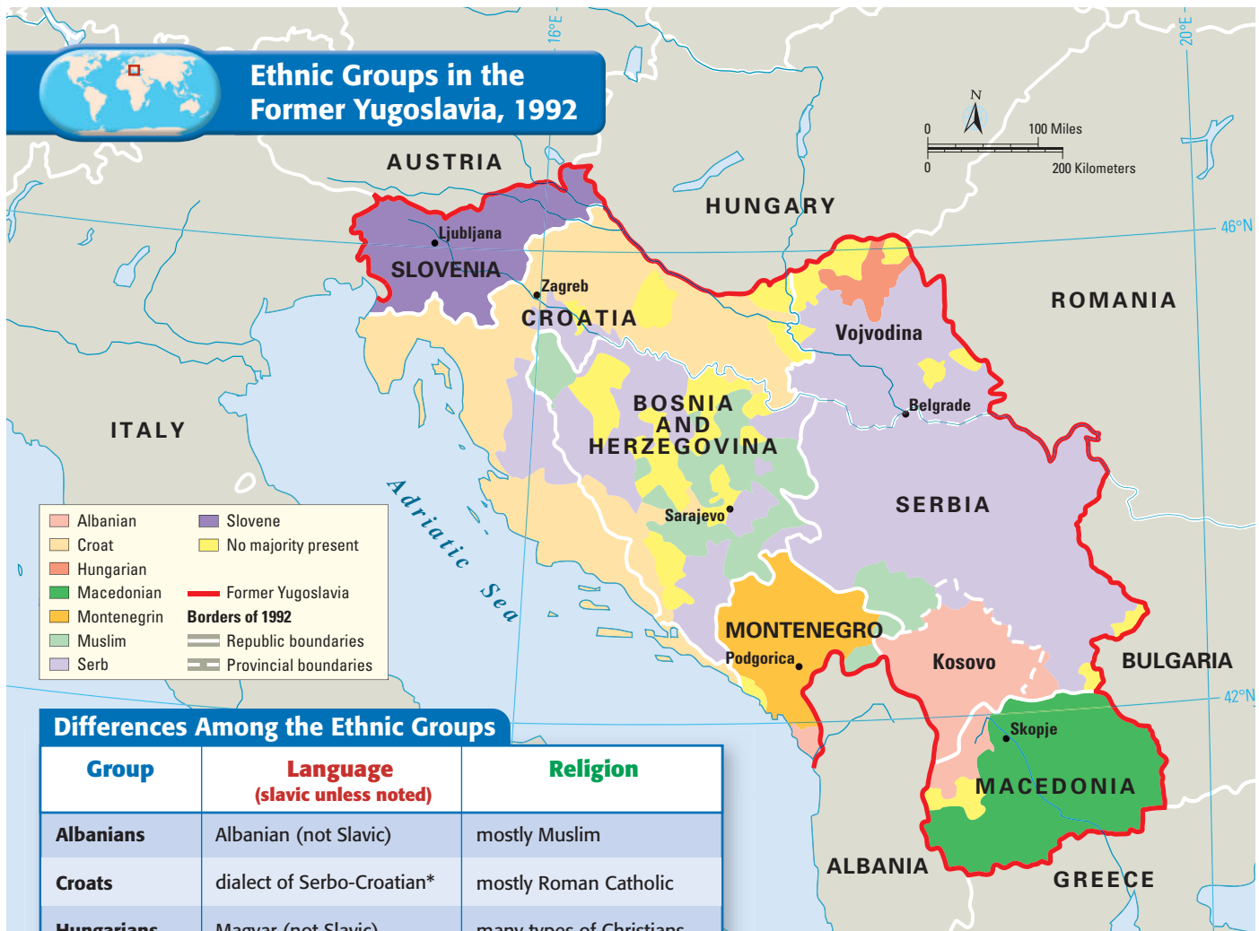
Differences Among the Ethnic Groups

Many ethnic and religious groups lived within Yugoslavia, which was a federation of six republics. The map shows how the ethnic groups were distributed. Some of those groups held ancient grudges against one another. The chart summarizes some of the cultural differences among the groups.